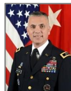
LTG Paul Nakasone '92